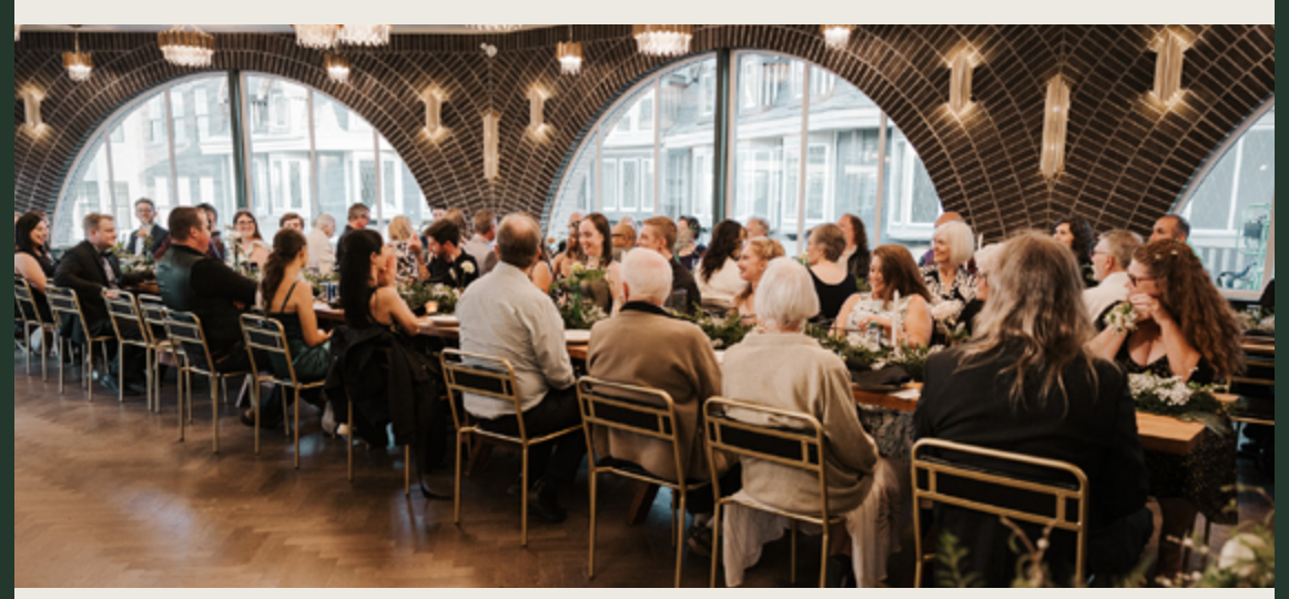
MAXIMUM CAPACITY 86 PEOPLE

Up to 74 people seated at long tables, and up to 12 at the head table.