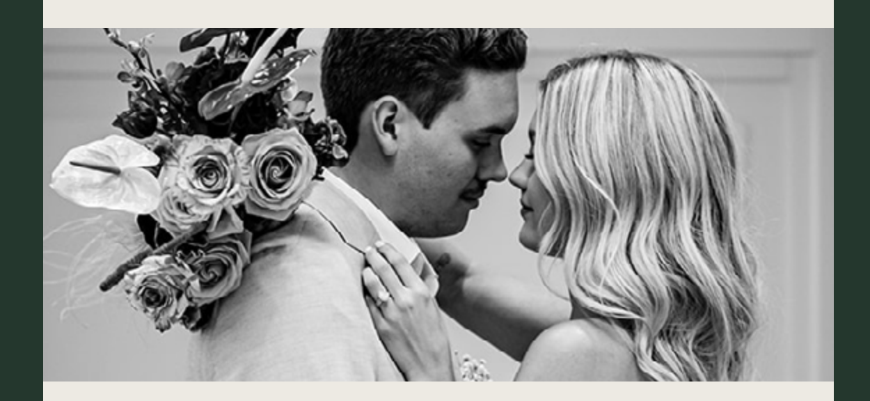
MAXIMUM CAPACITY 110 PEOPLE