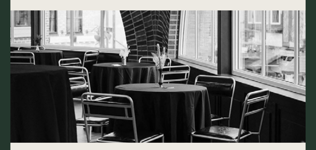
MAXIMUM CAPACITY 76 PEOPLE

Up to 64 people seated at round tables, and up to 12 at the head table.